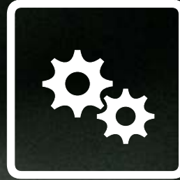
Technical & Manufacturing