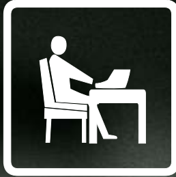
Secretarial & Hospitality Services