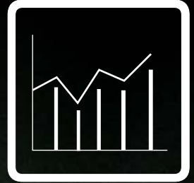
Auditing of Local Project Costs