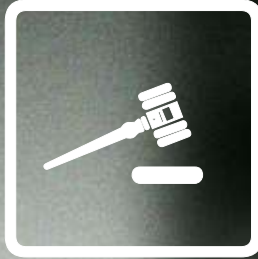
Company Affairs & Legal Matters